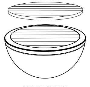
3171603 / 101524 To suit Orbis fire pit